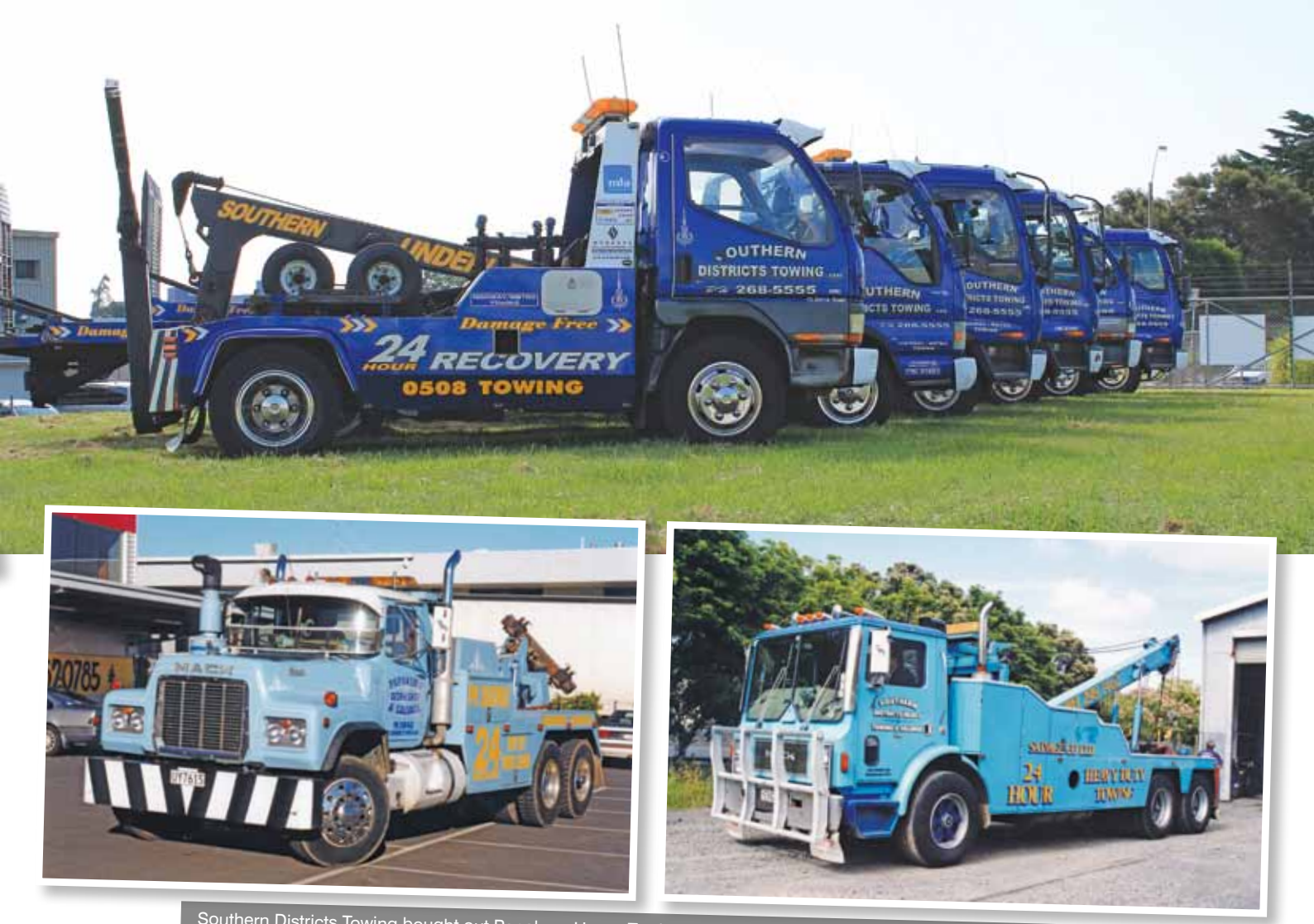
Southern Districts Towing bought out Papakura Heavy Towing and Salvage which kicked off the heavy recovery work

The firm currently services in excess of 300 customers around the greater Auckland area. Their clients include major insurers, government departments including Auckland Transport. They also offer breakdown and recovery services for the AA, First Assistance and Youi and are currently the preferred provider to Counties Manukau Police, a longstanding arrangement with over 20 years of service involved.