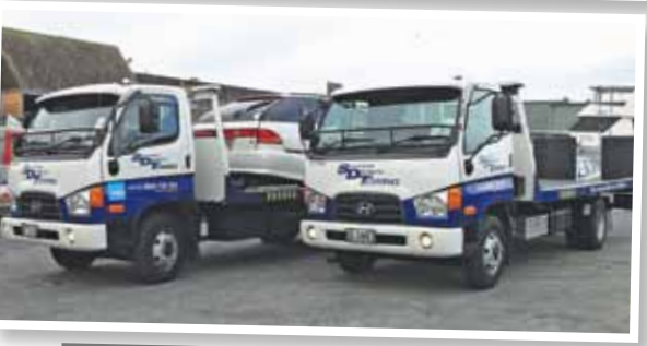
The original dark blue livery is being updated