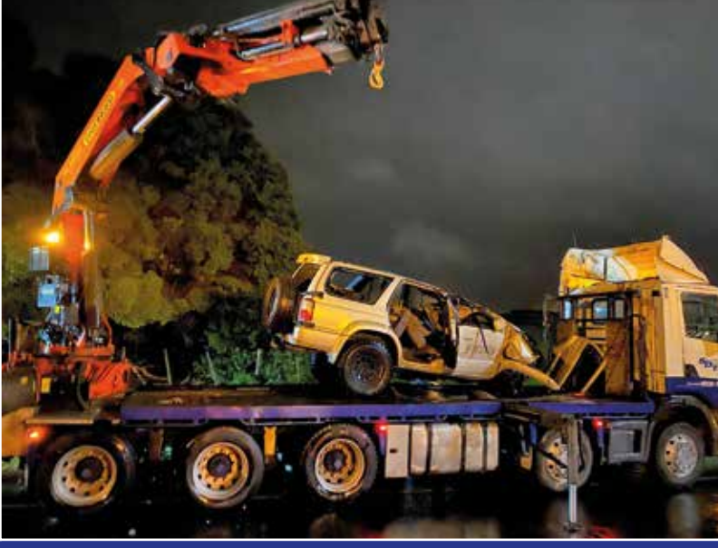
All pictures, clockwise from this page, top: Three SDT units at an accident scene. The 8x4 Isuzu slide-back deck unit has the light truck on board, the Inter has a tractor unit and the Mack is recovering the trailer....light-duty Hino underlift unit can, by fitting a dollie under the towed vehicle's rear wheels, recover vehicles without having access to them....the Inter swaps its usual highway environment for Auckland International Airport - to recover an airline catering truck....old MC Mack was SDT's first heavy-duty towtruck....the Hiab flatdeck unit is invaluable in recovering crashed vehicles while maintaining their condition for possible ongoing investigations.....Hiab can also aid tricky vehicle recovery

He started off in towing as a "young fella" in Australia and has had various positions within the transport industry, including a management role with First Assistance, working for another towing company and operating as an independent insurance assessor.