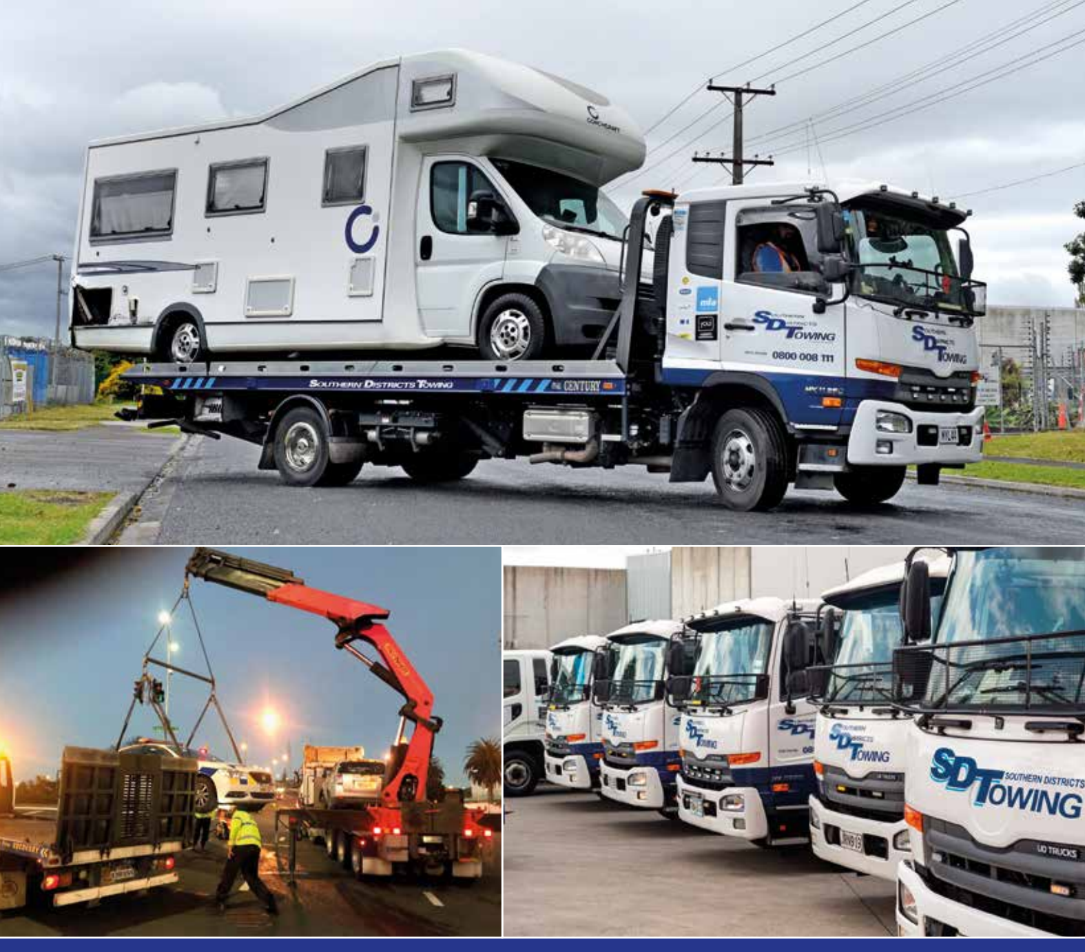
Top: UD slide-deck unit has an 11-tonne rating Above, left: Usually SDT is working with the Police....but this time it's a patrol car that also needs recovering Above, right: The fleet is versatile...and features a variety of truck makes

lane, the congestion increases by three kilometres — it can back up so quickly."