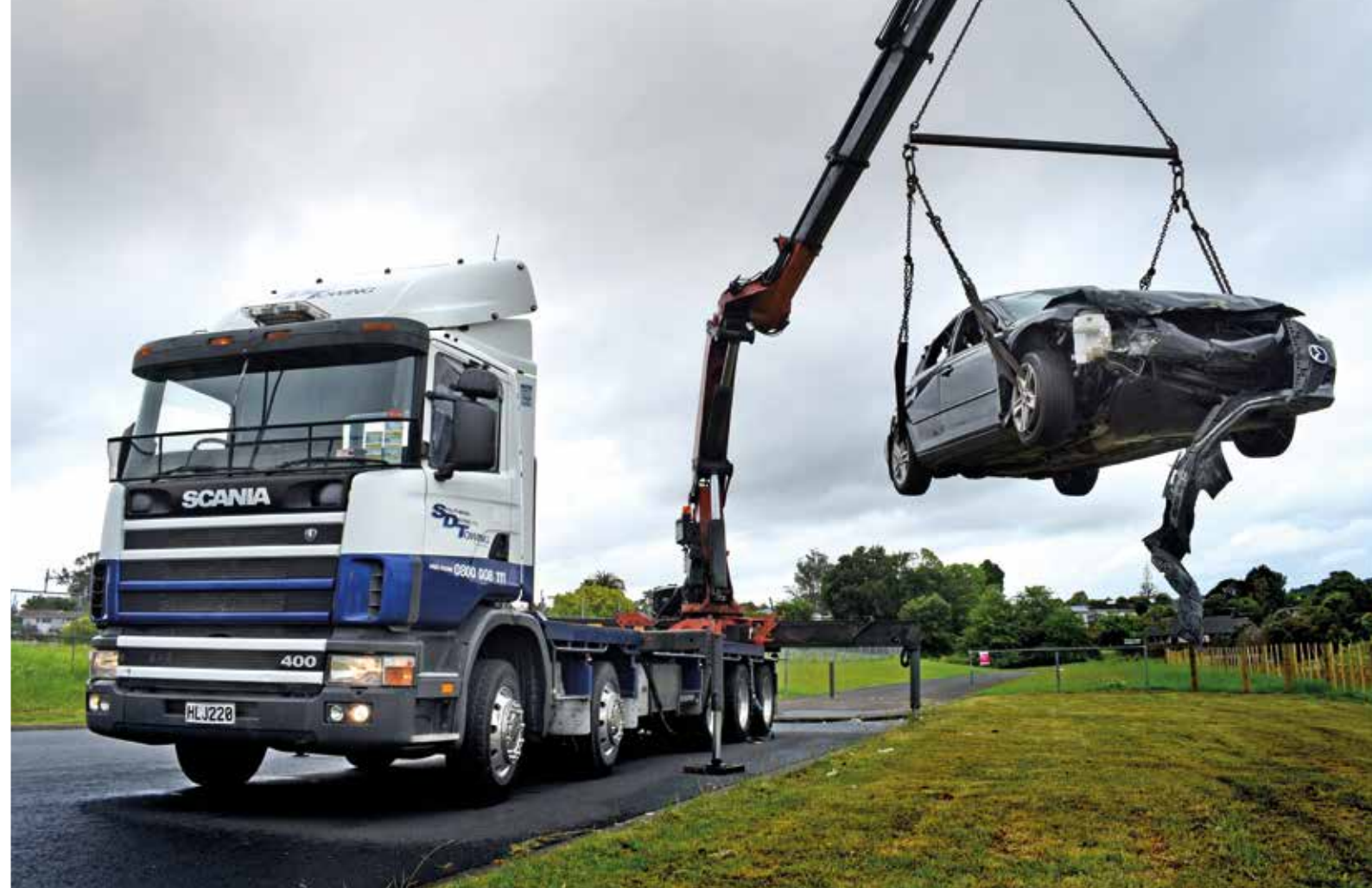
Scania 400 10x4 Hiab unit, capable of lifting up to 12 tonnes close in, recovers a wreck

SDT's business and operations manager – was working as a manager for one of the company's big customers, the First Assistance roadside assistance network.